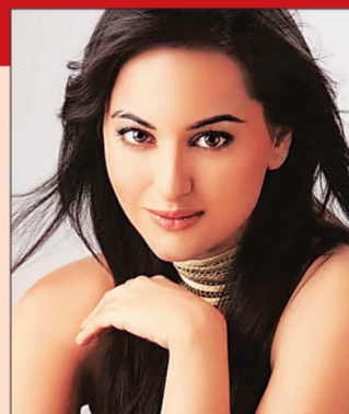
Actor Sonakshi Sinha topped the search for the fastest rising Bollywood celebrities