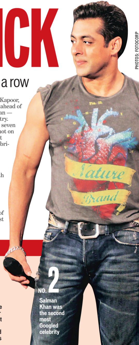
Salman Khan was the second most Googled celebrity