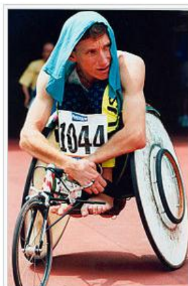
Australian T50 wheelchair athlete Fabian Blattman shades himself with a towel while he waits for his event at the 1996 Atlanta Paralympic Games ↗

You can also upload your own pictures to Commons. More information about that can be found at http://c.enwp.org/Commons:First_steps/Upload_form